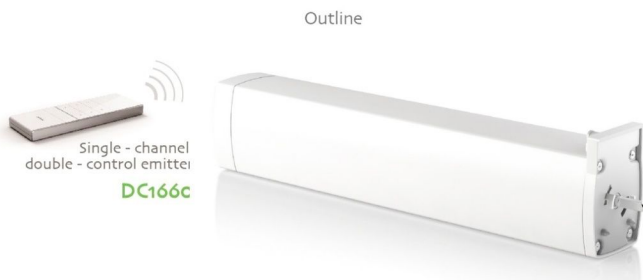
Single - channel double - control emitter DC166C

Electronic limit+Built-in receiver+Resistance and stop function+Light touch start function+The third limit position+Power off manual function + External connecting with strong current switch+ External connecting with dry contact function+RS485 communication function